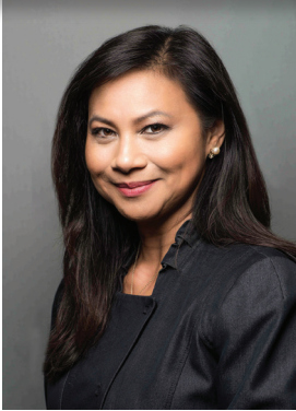
Aurora Austriaco Shareholder, Valentine, Austriaco & Bueschel, P.C.